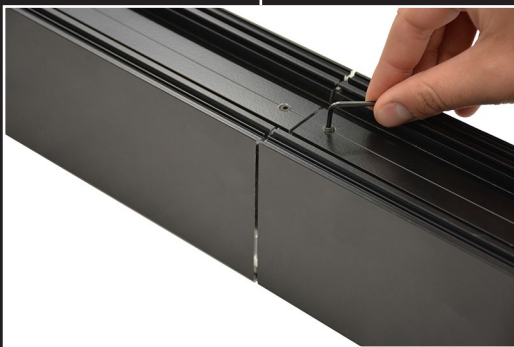
Step 2 Tighten