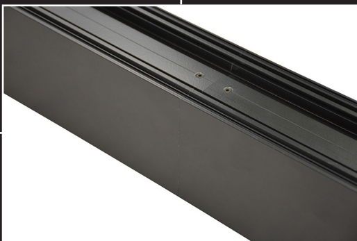
Step 2 Examine